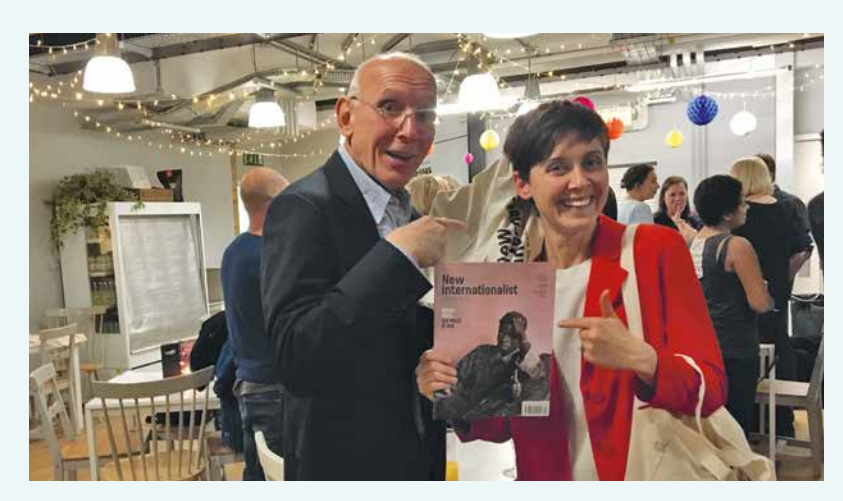
Co-owners at a New Internationalist general meeting in 2019.